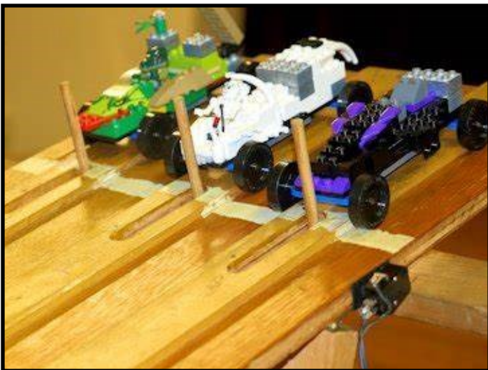
LEGO® Derby Cars