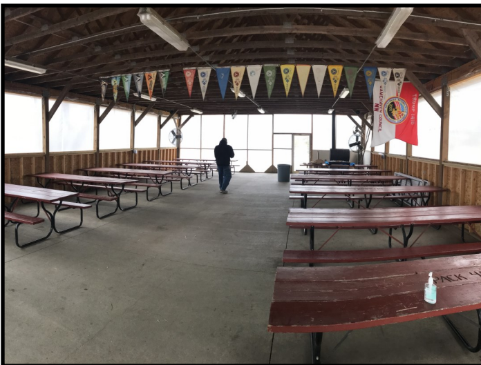
Cub Scout Pavilion