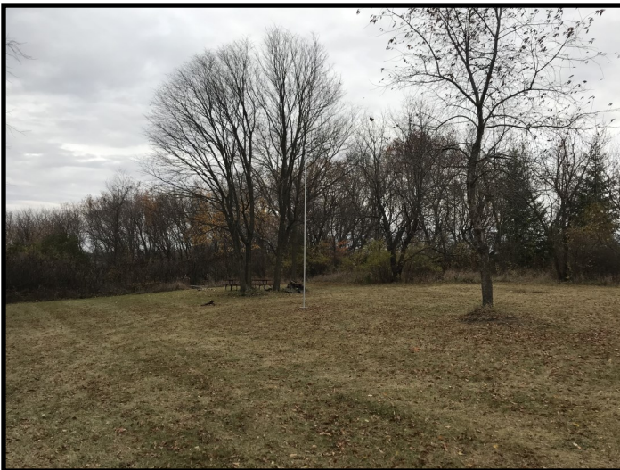
Hawk Point (Family Campsite Example)