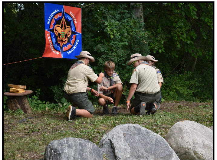
Tindeuchen Fire Bowl