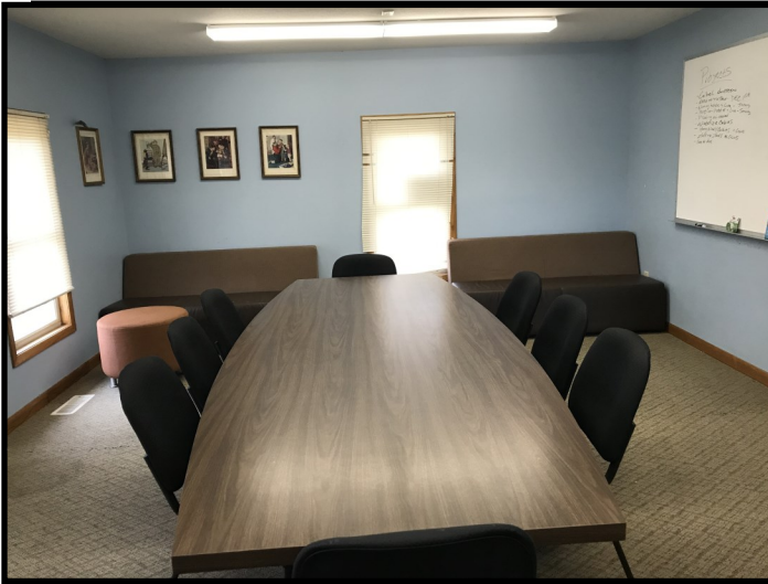
Admin Building—Conference Room