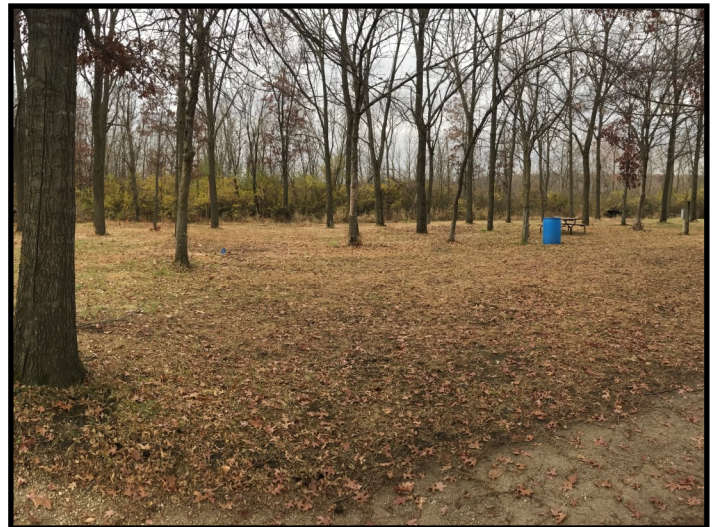
Staff City (Modern Campsite Example)