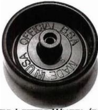
RAISED LETTER WHEEL (REAR)

Wheels will be inspected for lettering; raised lettering may not be sanded off.