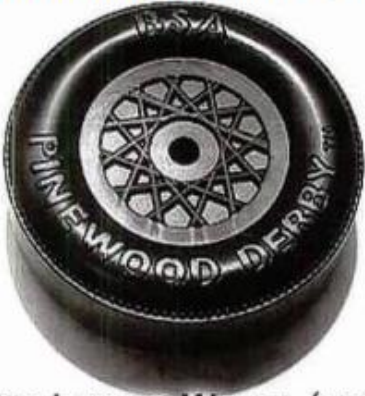
RAISED LETTER WHEEL (FRONT)

Note: In the above left picture, you can see the “outer edge tread” which must be maintained.